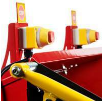
TP E-STOP is standard for operator safety