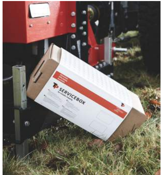
TP SERVICE BOX

The hot-dip galvanized trailer and chassis are supplied from ALKO. Trailer includes overrun brake. The woodchippers are delivered with a Certificate of Conformity to show that they are fully homologated and compliant with the European Directive 2007/46/EC. All TP woodchippers comply with all existing safety standards (EN 13525)