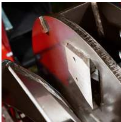
Displaced blades (2 pcs.) constantly engaging material