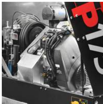
Powerful Kohler EFI engine