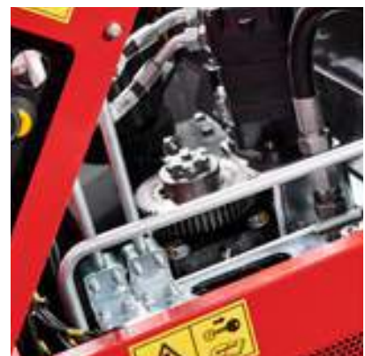
Danfoss hydraulic engine