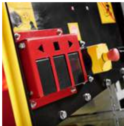
TP Easy Control Reset – Reserve – Go function