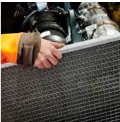
Filter for easy cleaning